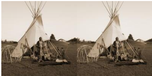
The American West